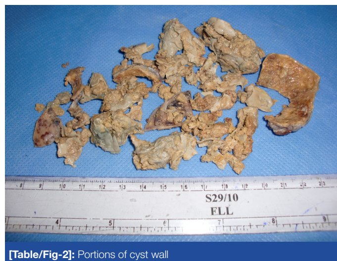
[Table/Fig-2]: Portions of cyst wall